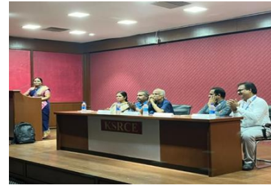
SEMINAR ON FUTURE TRENDS IN CYBER SECURITY ON 18-10-2024

The Workshop on UI/UX Design Using Figma provided participants with a strong foundation in user interface and user experience design principles, along with hands-on experience using Figma, a leading collaborative design tool..