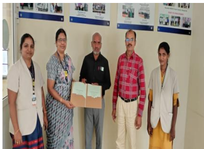
STACKQUEUE MOU INAUGURATION 2024-2025

A Memorandum of Understanding (MoU) was signed with Gateway Software Solution for the academic year 2024–2025. This collaboration aims to provide students with enhanced training, internship opportunities, and industry exposure through joint programs and workshops.