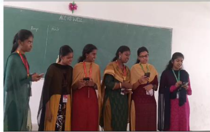
NON-TECHNICAL EVENT ON JIGSAW DEBATE ON 24-08-2024

The Non-Technical Event on Jigsaw Debate was designed to enhance participants' communication, critical thinking, and collaborative problem-solving skills.