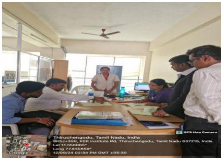
GATEWAY SOFTWARE SOLUTION 2024-2025

An MoU was signed with Gateway Software Solution for the academic year 2024–2025 to foster industry collaboration, internships, and skill development opportunities for students.