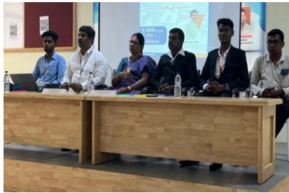
SPORIX ASSOCIATION INAUGURATION ON 12-09-2024

The Non-Technical Event on Jigsaw Debate was designed to enhance participants' communication, critical thinking, and collaborative problem-solving skills.