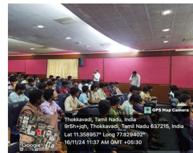
ORIENTATION PROGRAMME ON ROLE OF GLOBAL CERTIFICATION IN IT SECTOR ON 16-11-2024

The International Seminar on Preparing Datasets for Predictive Modeling provided participants with an in-depth understanding of the critical role that data preparation plays in building accurate and reliable predictive models.