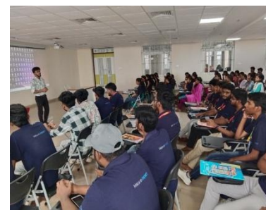
SEMINAR ON PHOTOSHOP ESSENTIALS ON 24-08-2024

he "How to Crack Competitive Exams" seminar is designed to equip students with essential strategies, skills, and mindsets needed to excel in various competitive examinations. Participants will gain a clear understanding of exam patterns, time management techniques, and effective study planning tailored to their