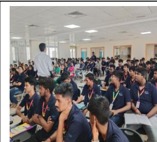
SEMINAR ON HOW TO CRACK COMPETITIVE EXAM ON 10-08- 2024

The GitHub Workflow Mastery: Version Control and Automation workshop aims to equip participants with a comprehensive understanding of modern collaborative development practices using Git and GitHub.