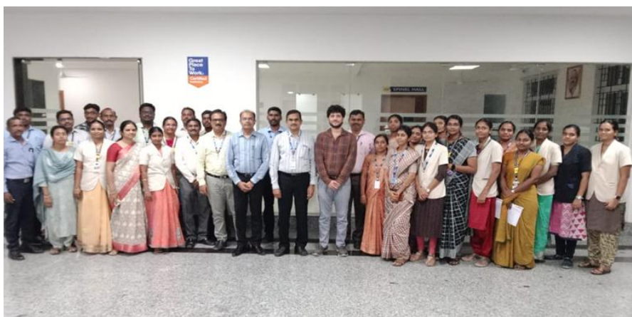
FACULTY TRAINING ON "GENERATIVE AI" from 17.12.2024 to 22.12.2024