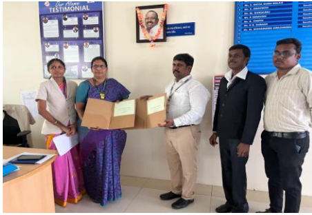
GATEWAY SOFTWARE SOLUTION 2024-2025

An MoU was signed with Gateway Software Solution for the academic year 2024–2025 to foster industry collaboration, internships, and skill development opportunities for students.