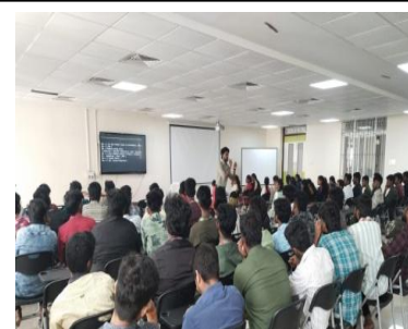
WORKSHOP ON GITHUB WORKFLOW MASTERY: VERSION CONTROL TO AUTOMATION ON 27-07-2024

The GitHub Workflow Mastery: Version Control and Automation workshop aims to equip participants with a comprehensive understanding of modern collaborative development practices using Git and GitHub.