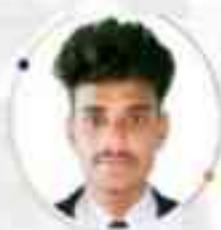
ASWINTH A REBAR DESIGN AND DETAILING SERVICES