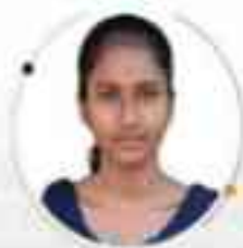
SONA P REBAR D&D