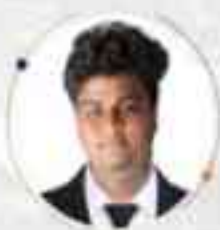
BALAJI E REBAR DESIGN AND DETAILING SERVICES