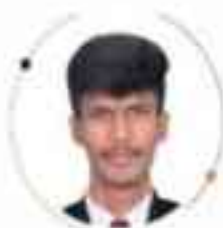
LOGAJEETH P AARBEE STRUCTURES